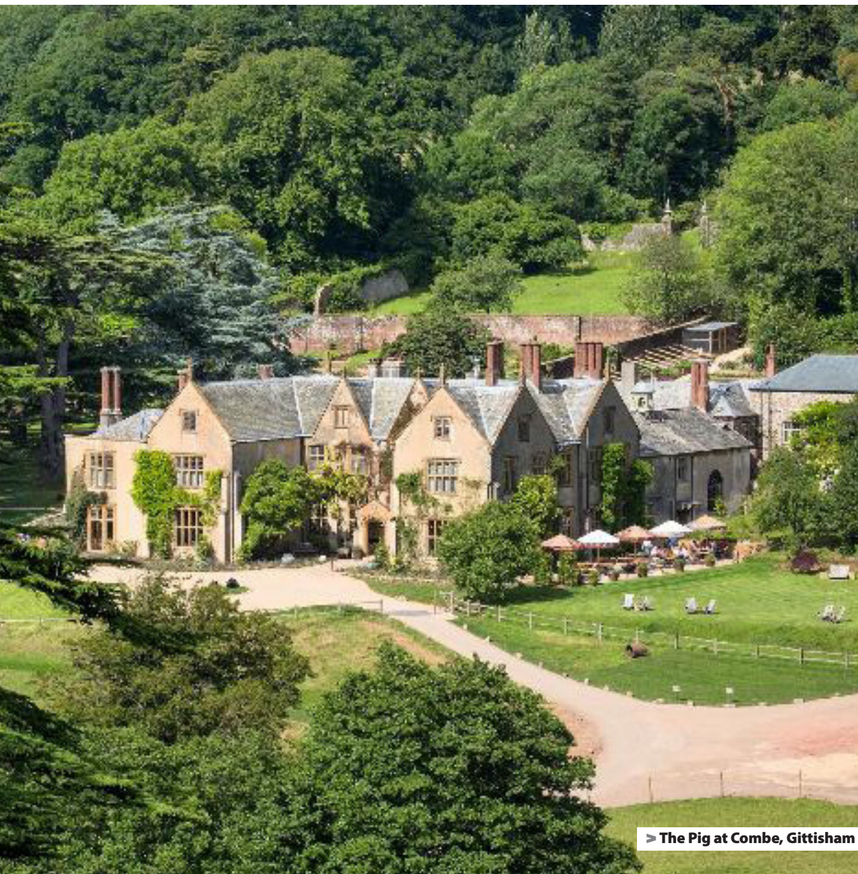
> The Pig at Combe, Gittisham